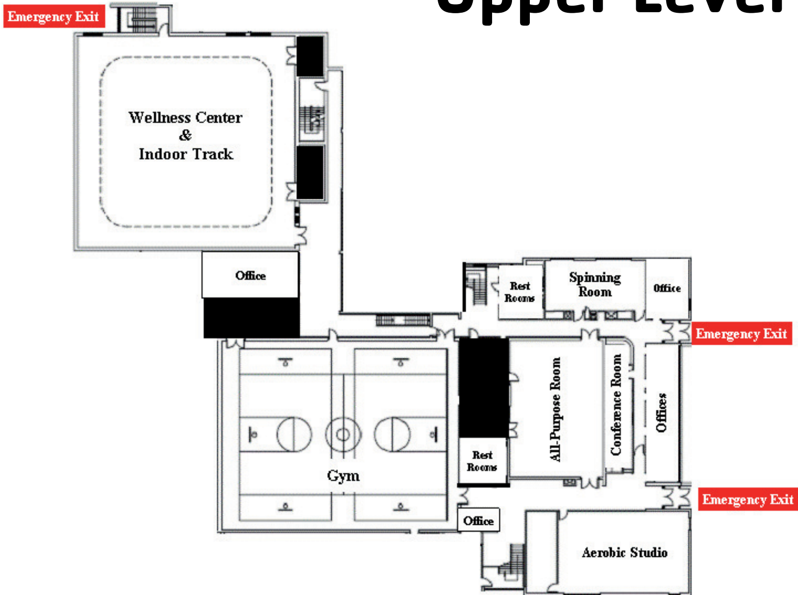
YMCA Upper Level Floor Plan