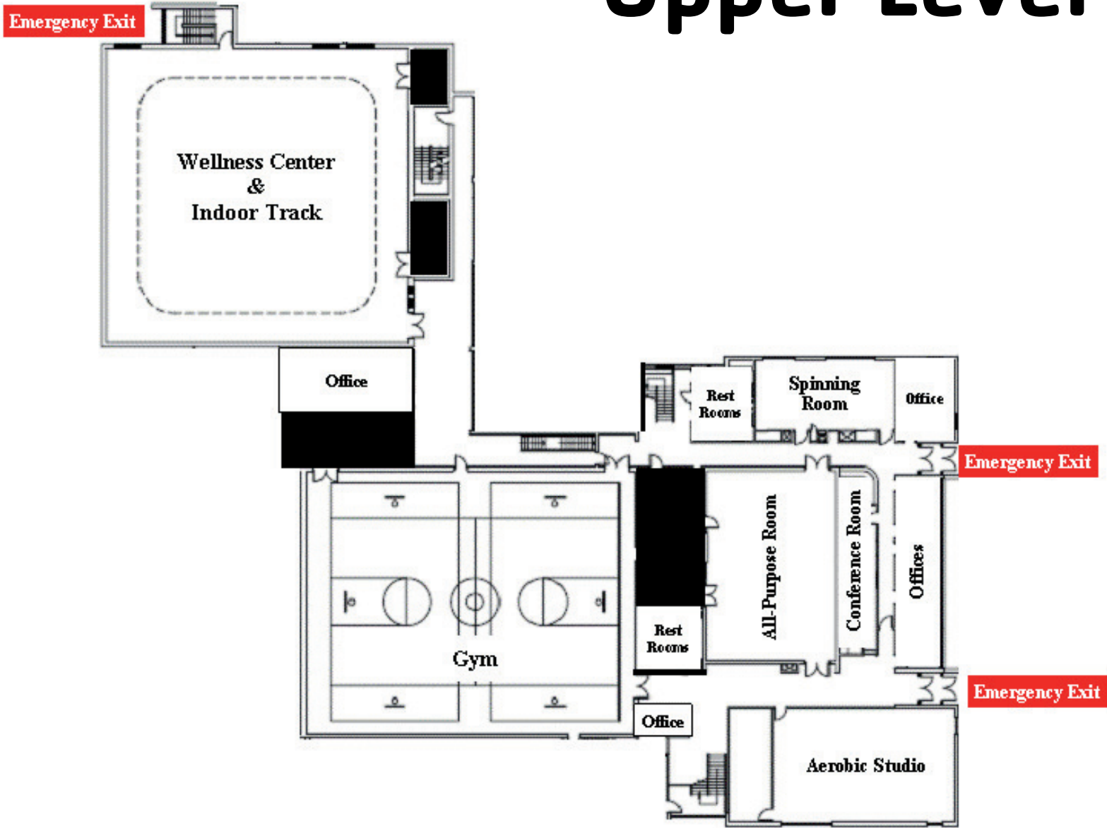
YMCA Upper Level Floor Plan